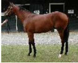
Bay Colt Foaled May 07, 2002 in New York